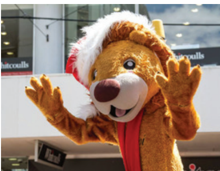
HOSPI, Wellington Children's Hospital Mascot.

Hospi will be helping Santa get ready for Christmas this year in the Wellington Hospital Atrium. From 8th December – 22nd December you can meet and get