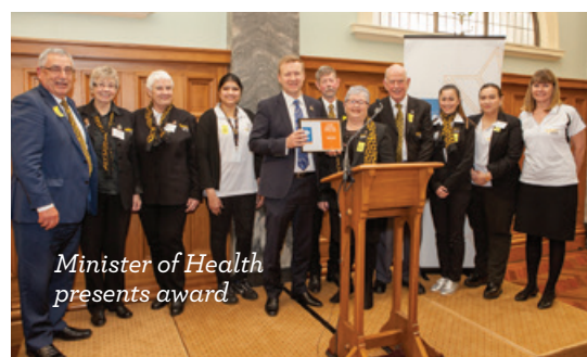
Minister of Health presents award

We were thrilled for our Volunteer Service to recently be recognised by the 2017 Ministry of Health Volunteer Awards as the overall winners. This is great recognition for all our volunteers at Wellington & Kenepuru Hospitals, Wellington Children's Hospital and Kapiti Health Centre, and is a huge achievement for the 450+ strong team of volunteers who give up their time each week to assist patients and visitors. Congratulations to all our volunteers.