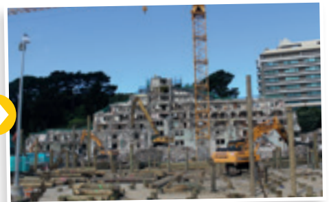
MARCH 19: 900 piles are drilled into the ground

A massive thank you for your support of our "All Brand New" Children's Hospital appeal so far. Our vision for the modern new children's hospital is a bold one, but together we can make the dream a reality. Along with a stunning new building, with your help we can make sure that it is equipped with cutting edge medical equipment and family and outdoor spaces that are welcoming, well-appointed and world class - all of which will help sick kids recover more quickly. Our new hospital will serve our children well for many years to come!