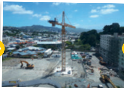
DECEMBER 18: The crane goes up!