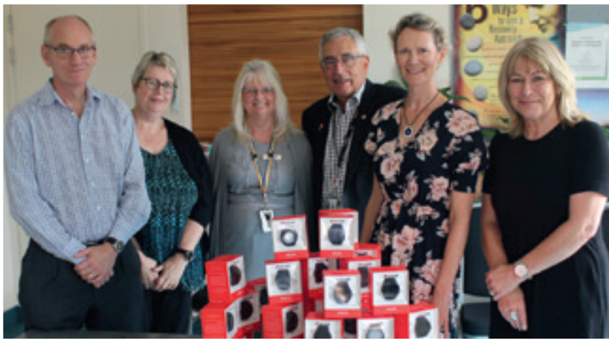
Staff with the new fitness trackers

The Foundation, together with support from Wellington Community Trust and New Zealand Community Trust, has funded a number of fitness trackers for the Mental Health Directorate in Kenepuru. This equipment is part of a fitness project called “Hikoi iti, Hilo nui” (Little steps, Big steps) to help support the social, mental and physical benefits of exercise for people living in long-term hospital care, particularly those with a serious mental illness.