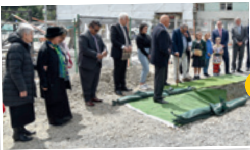
NOVEMBER 18: Mauri stone laying ceremony marks the start of the build

Next time you're passing, be sure to stop and take a look at the exciting work going on.