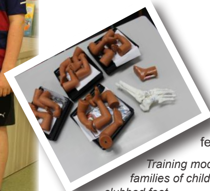
Training models help families of children with clubbed feet.

Having a child with clubbed feet can be extremely distressing for parents. There may be several surgeries needed as well as many months of plaster casting to reposition the feet. We were pleased to be able to fund three sets of Ponseti and Tenotomy Models that will greatly assist our clinical staff in informing and supporting families through this difficult process.