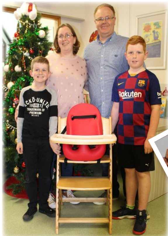
The Swan Family

A huge thanks to the Waipawa Lions Club for their generous donation to the Heart & Lung Unit at Wellington Regional Hospital. This donation has enabled the purchase of sought after heart models which will assist medical staff when explaining the treatment for coronary heart disease. The models include two classic heart models with arterial bypasses while the other two are life-sized diseased heart models with stents.