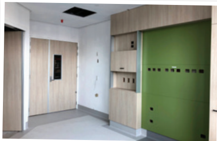
Prototype patient room shows bigger and more comfortable patient spaces