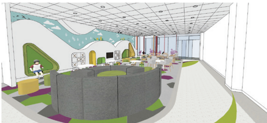
Artist's impression of one of the Rotary funded whānau spaces

Our friends at Rotary and Lions are also working hard to fundraise for some key spaces within the new hospital. These dedicated play and whānau spaces with kitchen and laundry facilities will also ensure a much better experience for families, especially those spending long periods of time in hospital during intensive periods of care and treatment with their sick children.