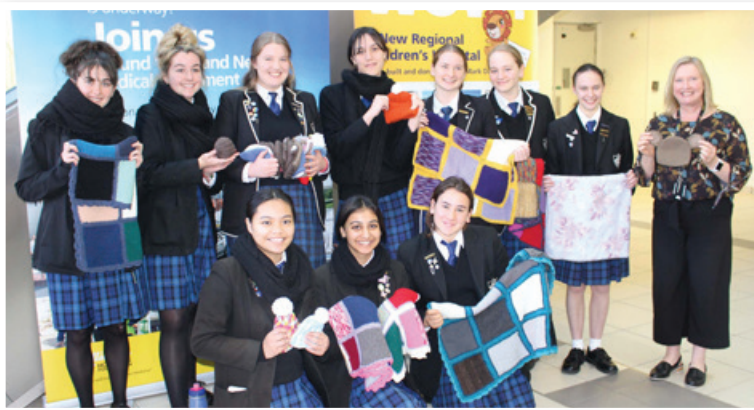
Clever college kids support our hospitals

St Catherine's College ran a "Share the Warmth" campaign where students brought in warm clothes and blankets for families in need, and as a part of that initiative every week about 40 students would meet and knit peggy-squares to make beautiful blankets and baby beanies. Thanks team!