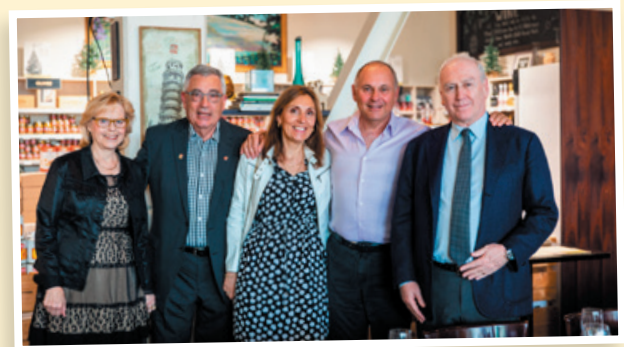
Mediterranean Food Warehouse Charity Dinner

Lions and Rotary Giant Book Fair to raise funds to outfit and equip the new hospital's PlayScape and the two dedicated whānau rooms.