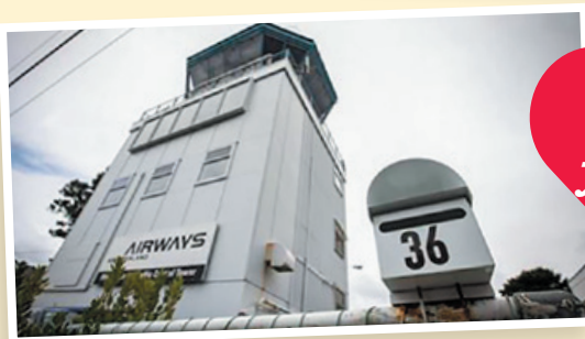
Donation of the commission on Tommy's Real Estate's sale of Wellington's old air traffic control tower

Molly is just one of the many kind and caring kids who pop in with generous donations for their new children's hospital.