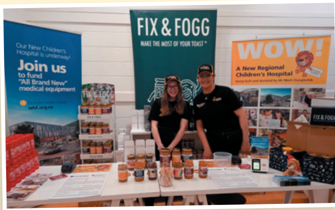
Christmas "Love Local" Pop Up shop collaboration with Fix and Fogg