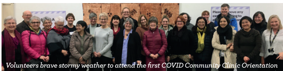
Volunteers brave stormy weather to attend the first COVID Community Clinic Orientation