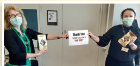
Whittaker's Chocolate donate a sweet treat to the hardworking teams of essential healthcare workers across Wellington and Kenepuru Hospitals during COVID19 Alert Level 3.